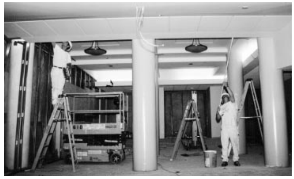
Paints used as part of the renovation were screened for environmental preferability.

DOD also reviewed environmental attribute information from governmental and private environmental certification programs around the world such as the German government's Blue Angel program, the Canadian government's Environmental Choice program, and Green Seal, an independent, nonprofit organization in the United States. While DOD project managers found that most of these programs focus on office and household products and appliances rather than construction materials, they did discover that several certification programs have examined paint products. Green Seal, for example, maintains 24 paint products in its database that have met its environmental standards. DOD referred to Green Seal's paint standards, including volatile organic compound (VOC) content levels and lists of prohibited organic and inorganic compounds in developing its paint specifications for the RFP (see page 9).